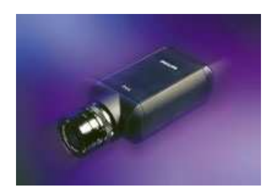
Figure 3: Philips CFT Inca311 Intelligent Camera

mvBlueLYNX [20]) solutions are often used, but singlechip LPAs (Xetal [21], added to Inca311 [22]) and even integrated sensor/LPA chips (MAPP2500 [23]) exist as well.