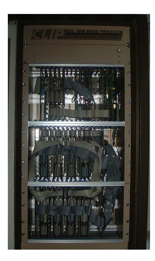
Figure 1: UCL CLIP4 SIMD image processing system

in many systems the array size was smaller than the image size, which made scanning of the array over the image necessary. For square arrays this involves a considerable overhead, in contrast with linear arrays. It can be proven [5] that with the same amount of chip area, it is more beneficial to make a linear array with a larger word-length than a square array with a small wordlength. Both the square and the linear SIMD array have the benefit that they are very flexibly programmable, and provided with indirect addressing of the image memory, also algorithms that address the pixels in an irregular way can be supported [6]. Still there usually is a gap both in hardware and in software between the SIMD system and its host, a PC or workstation.